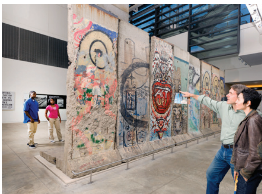
Berlin Wall Gallery

The Newseum features a "window on the world," which looks out on Pennsylvania Avenue and the National Mall.